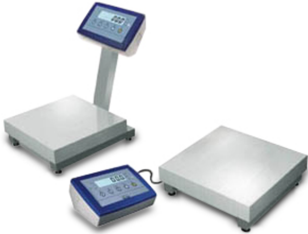
EPQI30 with or without TQNCI column